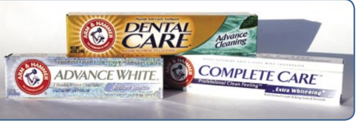
Today, consumers can choose from a wide variety of toothpastes that use baking soda as a primary cleaning agent to help keep the gums and teeth in a healthy state.

Dr. Rams: To prevent periodontal disease, it's a two-pronged approach: one, go after the dental plaque bacteria on tooth surfaces with intensive home tooth brushing, flossing and oral irrigation; and two, maintain healthy host resistance by eating a well-balanced, highly nutritional diet, exercising, not smoking, and reducing stress. Persons with poor oral hygiene who smoke, are overweight, deficient in vitamin C, and under excessive emotional and physical stress and distress are far more vulnerable to severe periodontal diseases and tooth loss. It is also essential to periodically undergo a thorough periodontal examination and diagnosis by a competent dental professional. It's a terrific public service to promote good periodontal health, because that will in turn help with good general health and promote a longer life span.