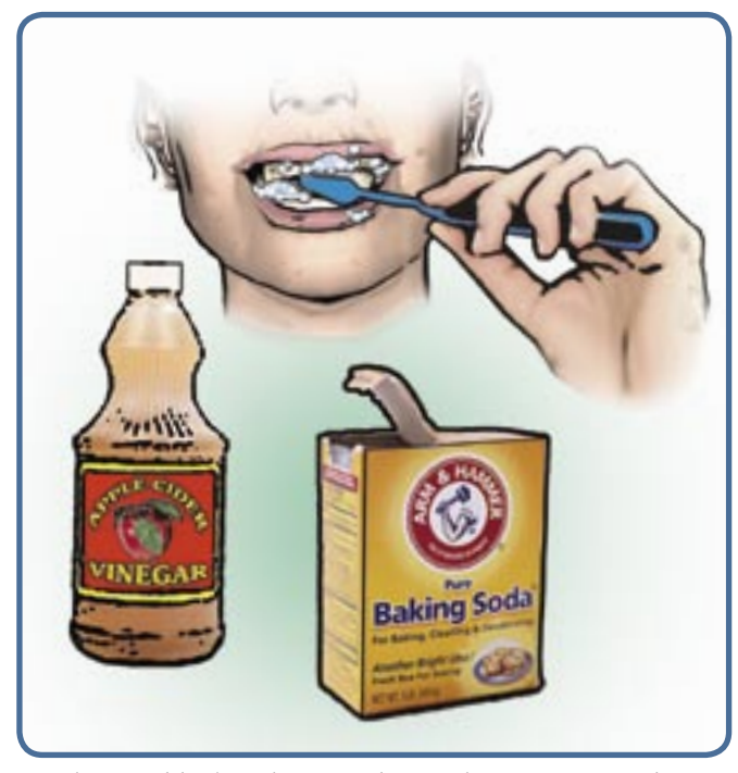
For the "world's best homemade mouth rinse." Dr. Paul Keyes—a pioneer of the nonsurgical solution to oral health uses baking soda and apple cider vinegar. When combined, the dynamic duo creates a foaming chemical reaction which eliminates the harmful bacteria that destroy teeth and gums.

The good news is that in most people gum disease is preventable, and very treatable if caught early